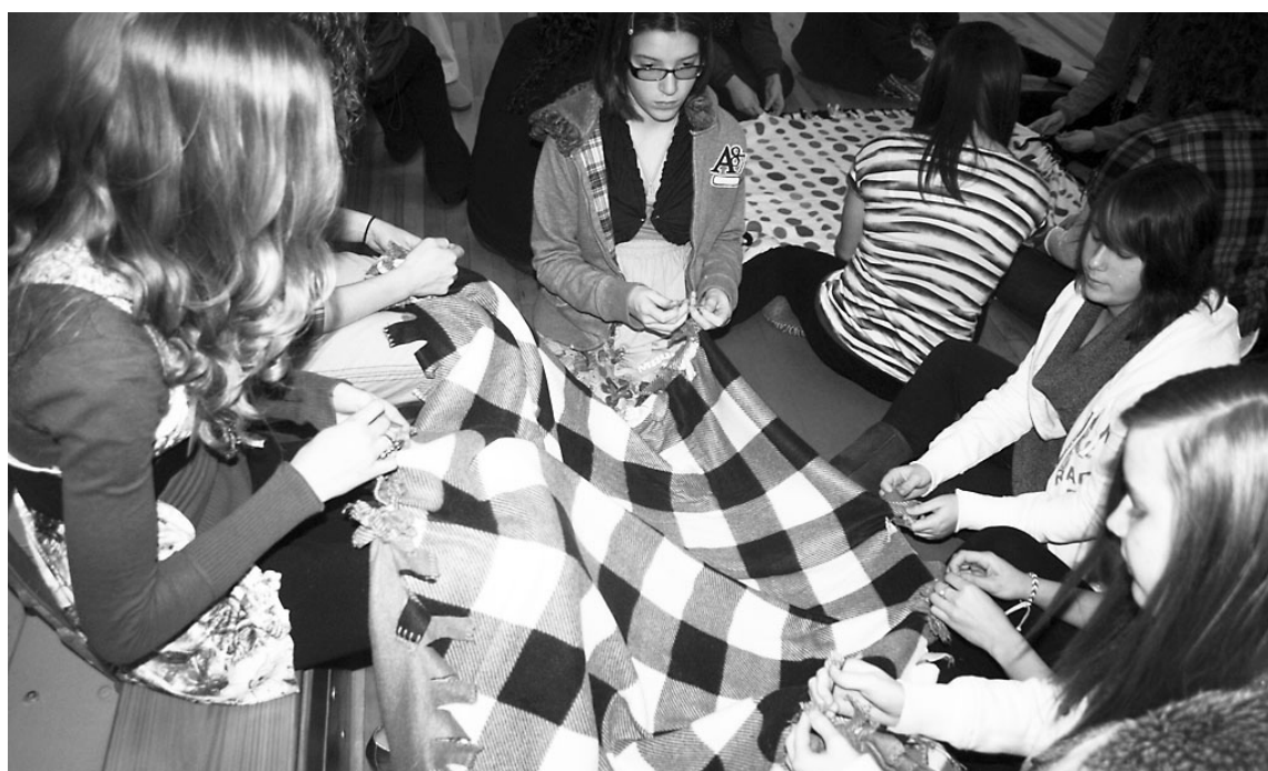
STUDENTS tie a fleece blanket for a service project at the KAY Conference held in Oberlin on Thursday.