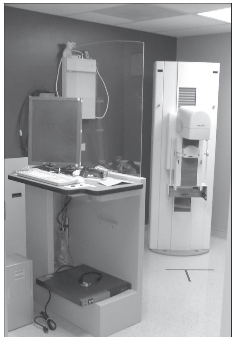
Digital Mammogram Machine Make an appointment now! call 785-475-2208