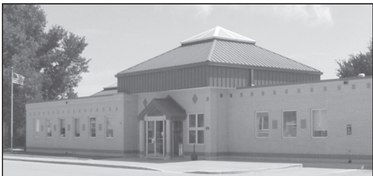
24 Hour Emergency Room