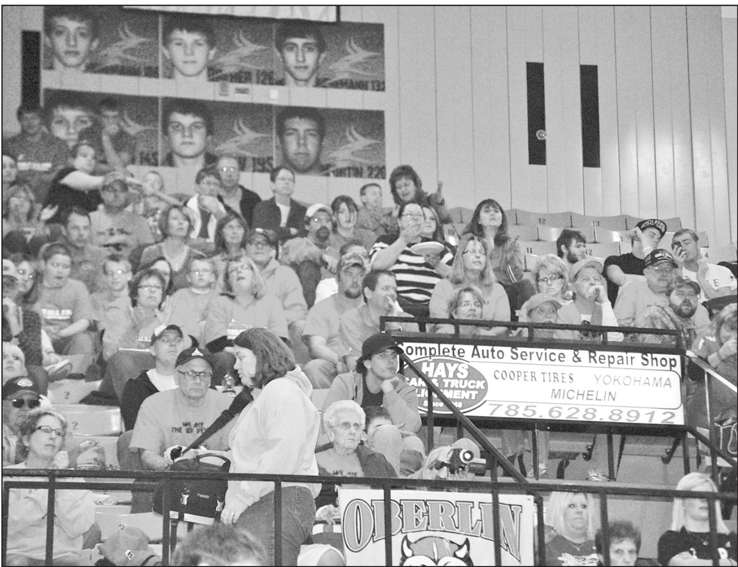
OBERLIN FANS CHEERED for the Red Devils wrestlers during the Class 3-2-1A State Tournament in Hays on Thursday and Friday. Story and more photos on OH! Page 1B.