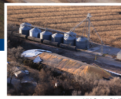
HM Cedar Bluffs