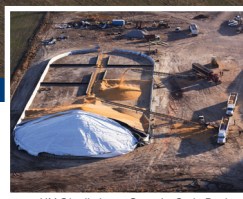
HM Oberlin Large Capacity Grain Bunkers