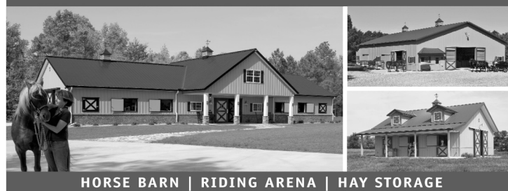
HORSE BARN | RIDING ARENA | HAY STORAGE