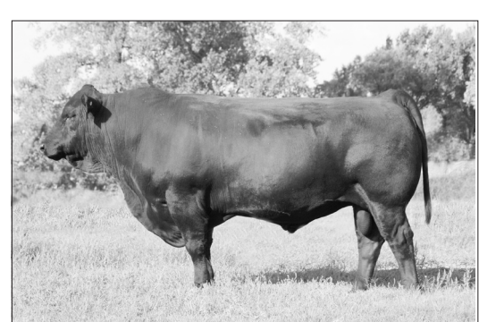
Governor Ozz Ext

Registered Yearling Gelbvieh and Balancer Bulls Blacks and Reds