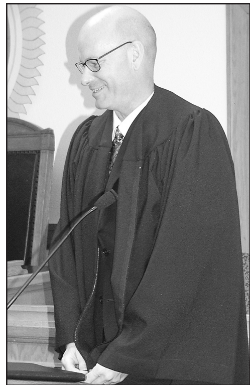
OBERLIN LAWYER, Preston Pratt was sworn in as the new 17th District judge on July 1, 2011.