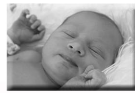
Kylar June 27 7lbs, 2oz, 21"