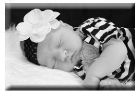
Colyns June 6 8lbs, 5 1/2oz, 20 1/2"