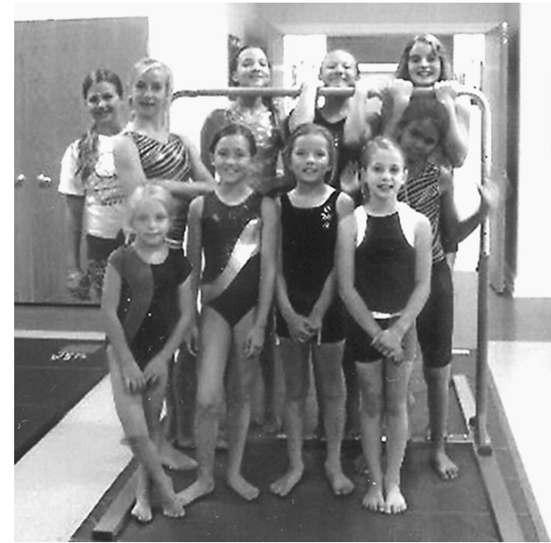
Creative Movements Gymnastics Coaches and Gymnasts

Creative Movements Gymnastics would like to thank Midwest Energy for the generous donation. We were able to purchase a Jr. Kip bar for the gymnasts. Thank you for supporting our youth.