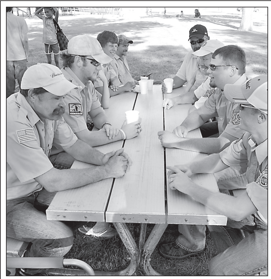
ALL THREE UNITS of the Decatur County Rural Fire Department – Jennings, Oberlin and Norcatur - came to Wednesday's fund raiser. The Oberlin volunteers here converged on their own table before chowing down.