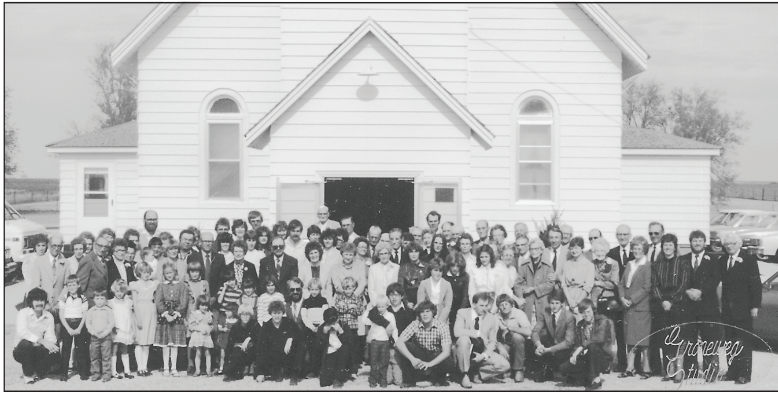
A LARGE CONGREGATION gathered outside the Lund Covenant Church at the 90th anniversary celebration in 1982.

Charter members were Sustava Noren, and the following couples: