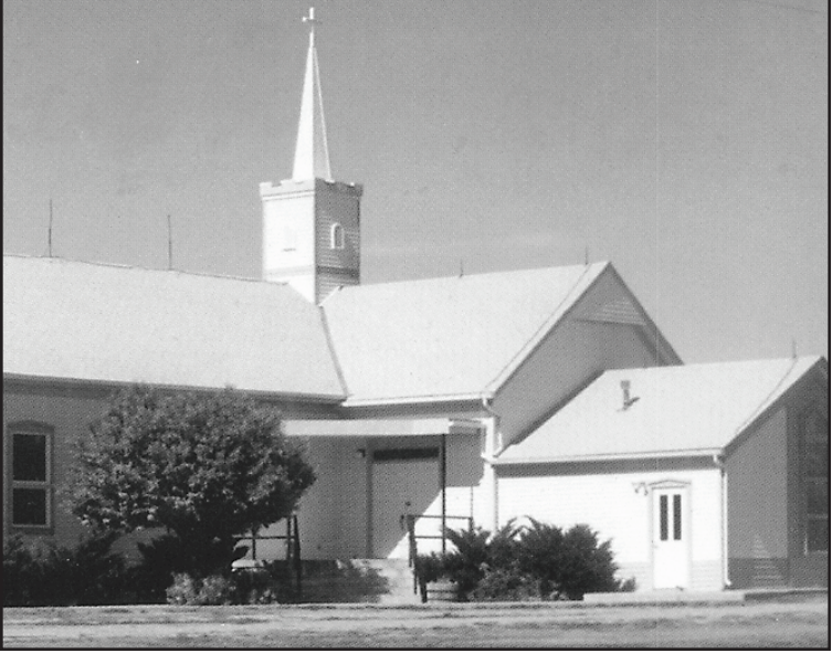
THE HERNDON COVENANT CHURCH was doubled in size with an addition in 1987.