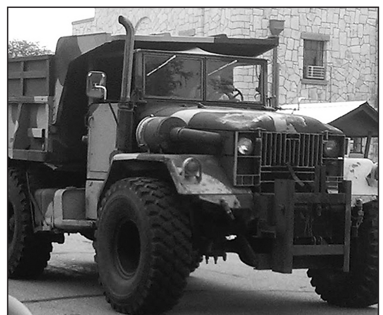
REFLECTING THE PARADE'S theme of "Too Hot to Handle" (left), this bunch of cool cuties rode on the float that promoted the Historic Building Preservation Committee. A military dump truck (above) was driven by Daryl Hartzog.