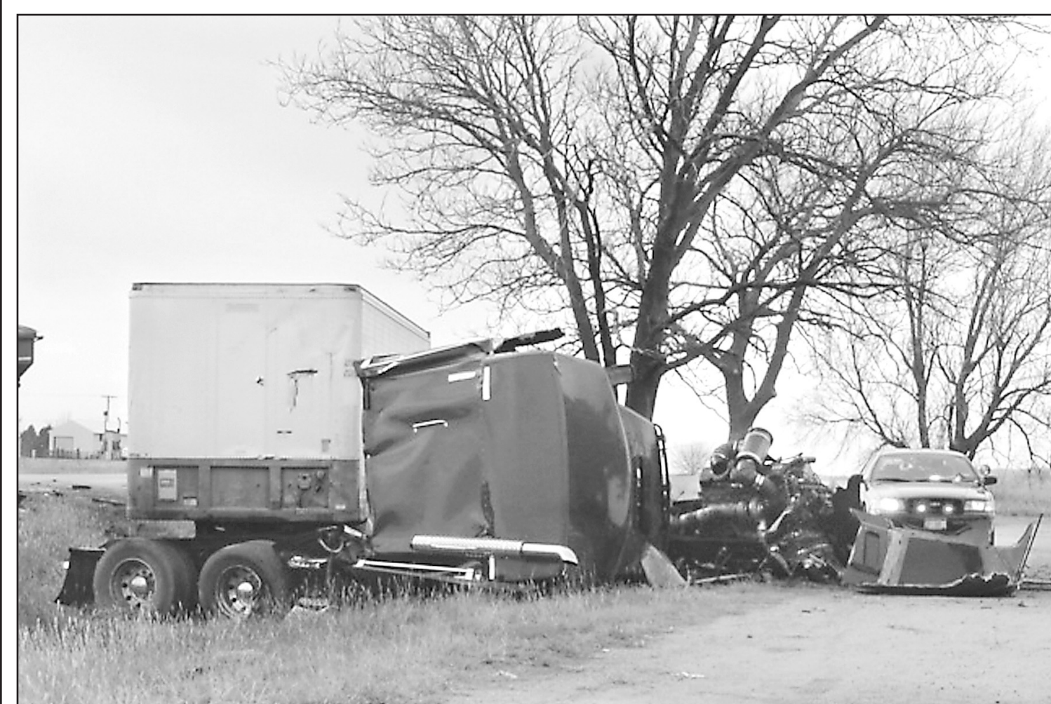
THE TRACTOR OF A SEMI-TRAILER truck from Nebraska (above) lay in ruins last Tuesday after it collided with a tractor pulling a grain cart (left) on U.S. 83 at the west edge of Selden. State troopers (far left) examined the

Mrs. Larson said that if the council passes the tax ordinance, it will go into effect on April 1. If it puts the decision off until January, it couldn't go into effect until July 1. Construction of the pool would begin next September, with the new facility to be open for Memorial Day 2014 if all goes well.