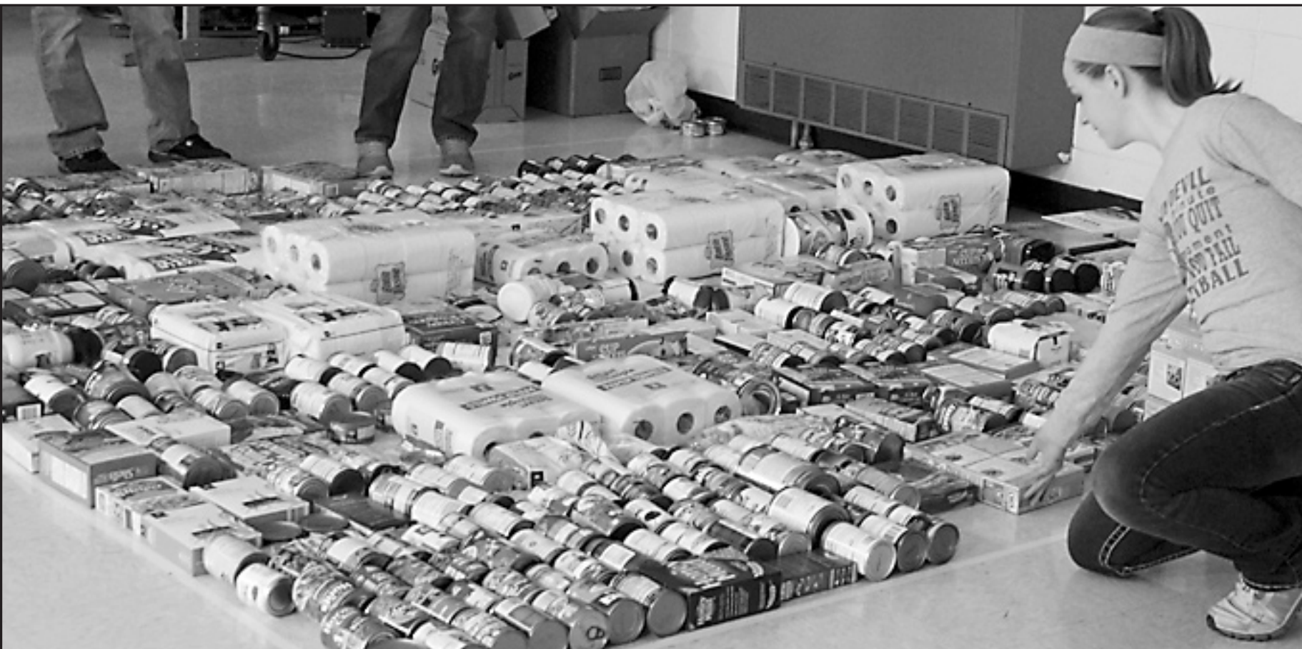
JUNIOR MIKI DORSHORST laid out canned food during the KAY's food drive.