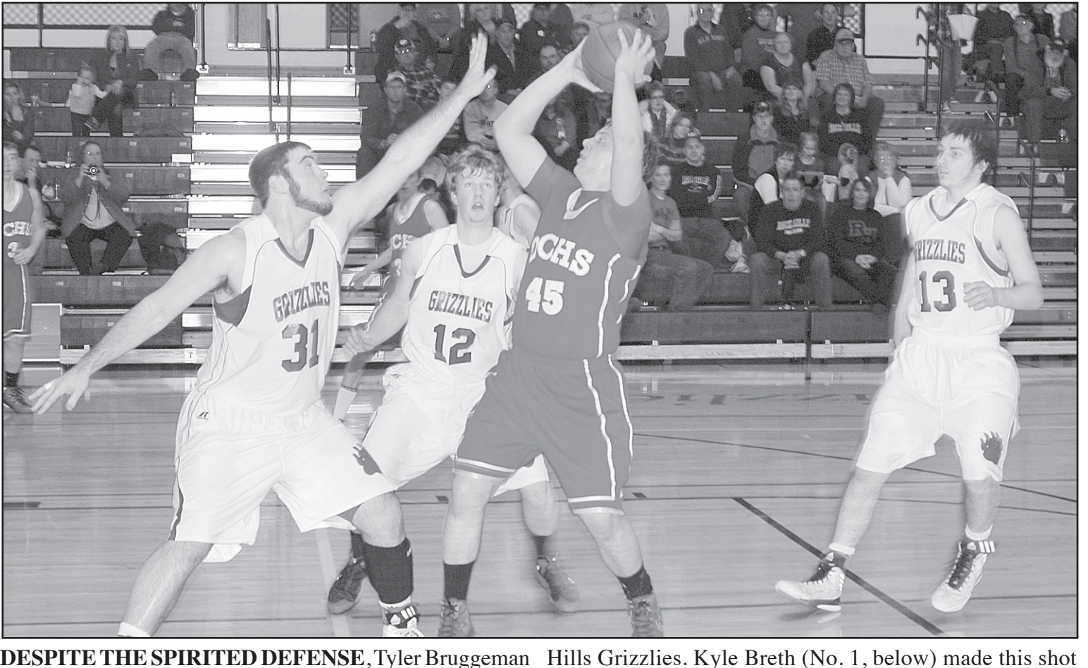
(No. 45, above) was not going to give up the ball to the Rock despite the efforts of a defender.