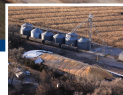
HM Cedar Bluffs