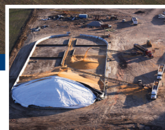
HM Oberlin Large Capacity Grain Bunkers